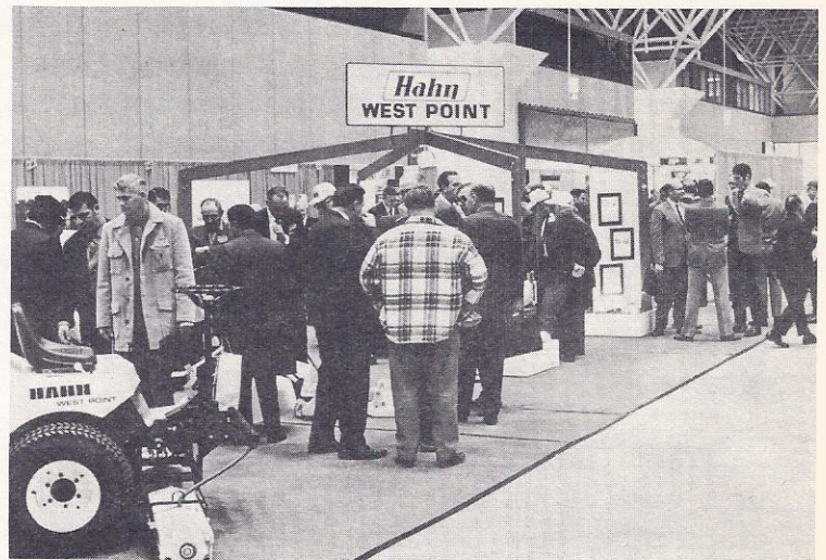
Denver Show Booth at 15 after 9:00 a.m.