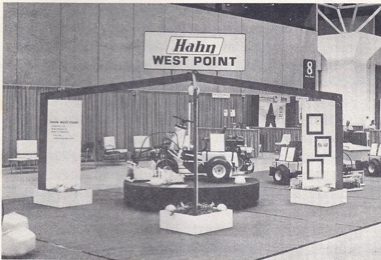
Denver Show Booth at 15 till 9:00 a.m.