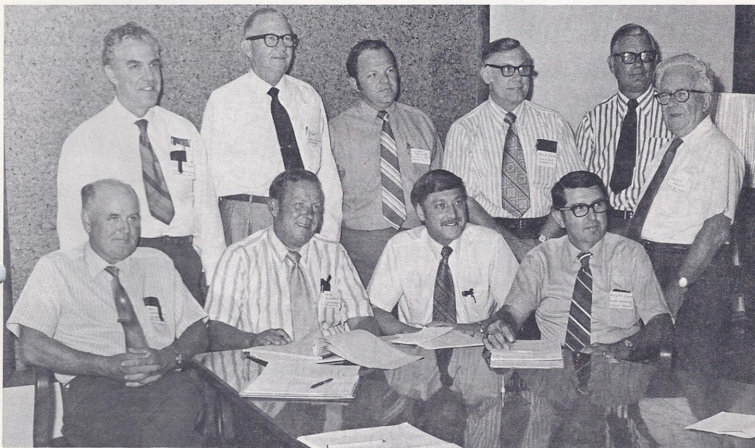
HAHN - WEST POINT ADVISORY COUNCIL MEETING

Hahn, Inc. is concerned about the problems of its distributors. To span the communications gap and provide its distributors with better service, high quality and sales aids to meet competition, Hahn has always had distributor advisory council meetings and receives many ideas from its distributors through these meetings.