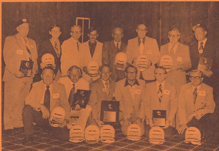
THE TOP "TOUGH ONES" TEAM